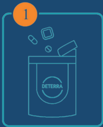
PLACE MEDICATION IN POUCH