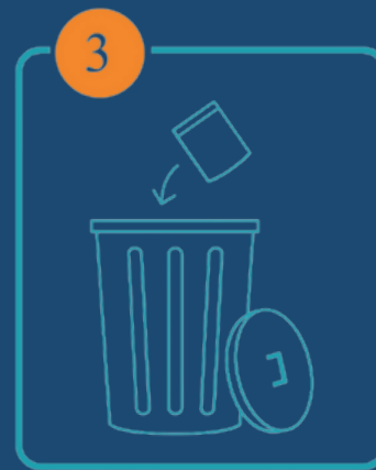
SEAL, SHAKE & DISPOSE IN TRASH

Deterra is on a mission to prevent drug misuse and protect our environment through safe, permanent disposal of unused prescriptions and over-the-counter medications. For more information visit Safe At-Home Medication Disposal | Deterra Drug Disposal System (deterrasystem.com) . Through a partnership with Deterra, CCA has purchased 18,000 Deterra bags for members to distribute throughout the year to encourage safe storage and disposal. To learn more about safe storage and disposal visit Florida Rx Safety .